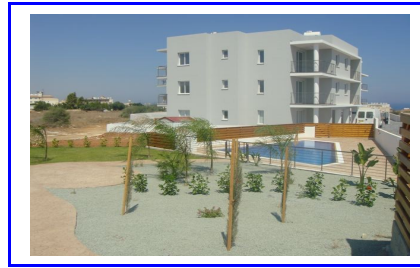
View of Apartment Block & Pool