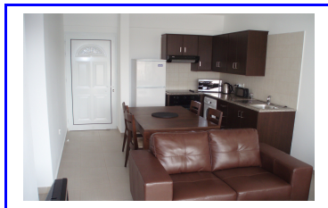
Lounge & Dining Areas